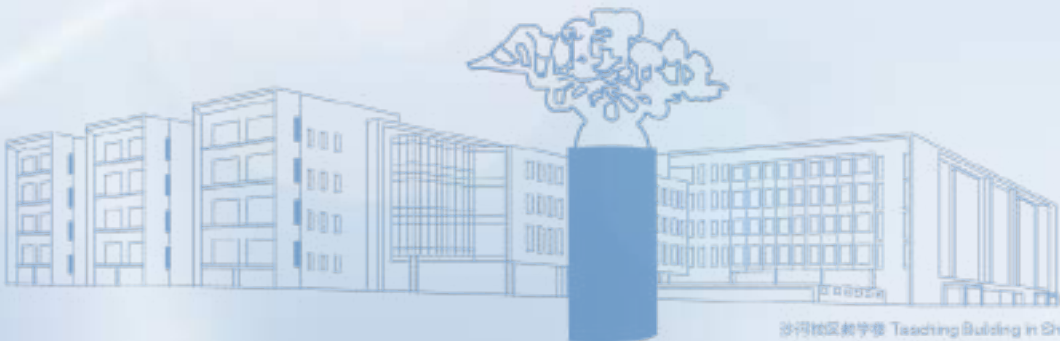
沙河校区教学楼 Teaching Building in Shahe Campus